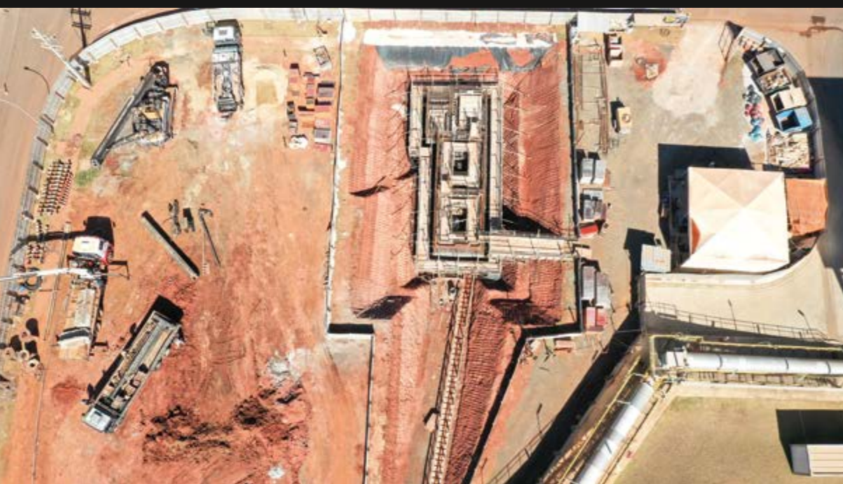
Status of the on-site construction works in May.

The Ortigueira mill will soon be 100% self-sufficient in sulfuric acid, which makes the mill a major chemical producer as well as a pulp producer. What is there to learn about the new process? Razzolini says, "At the site we generate oxygen, sodium chlorate, which generates hydrogen, used in the lime kiln. Chlorate is converted to chlorine dioxide. We also handle elements inside the cooking and evaporation process, as well as separate methanol, turpentine, and tall oil. In fact, there is actually a long list of what we already do, and we are very much heading in the direction of a true biorefinery when it comes to side streams generated from the mill."